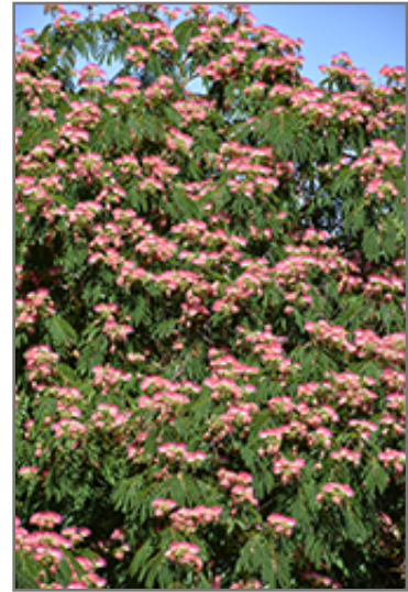
Ombrella Mimosa flowers

This plant is not reliably hardy in our region, and certain restrictions may apply; contact the store for more information.