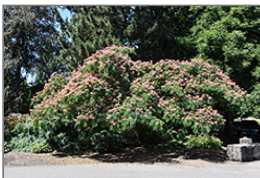
Ombrella Mimosa in bloom