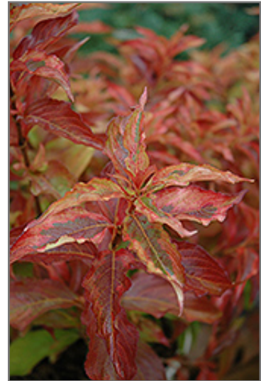
My Monet Sunset Weigela in fall

This plant is not reliably hardy in our region, and certain restrictions may apply; contact the store for more information.