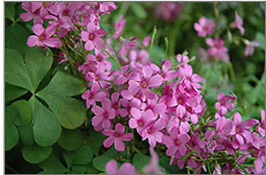
Pink Wood Sorrel flowers