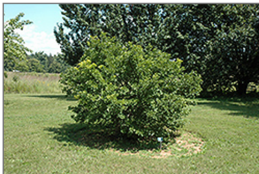
Jade Butterflies Ginkgo

Jade Butterflies Ginkgo is recommended for the following landscape applications;