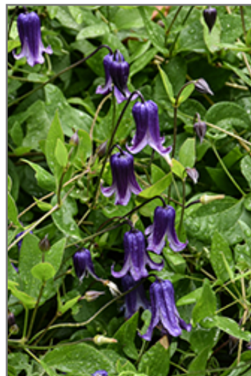
Rooguchi Clematis flowers