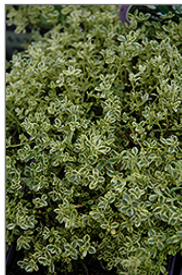
Highland Cream Creeping Thyme

Highland Cream Creeping Thyme is recommended for the following landscape applications;