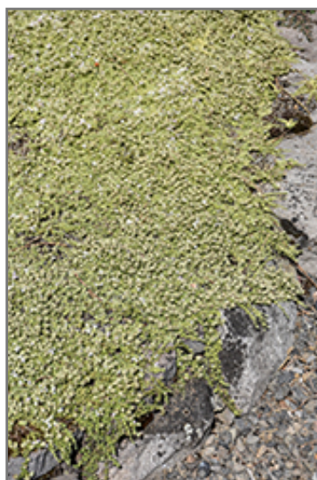
Highland Cream Creeping Thyme