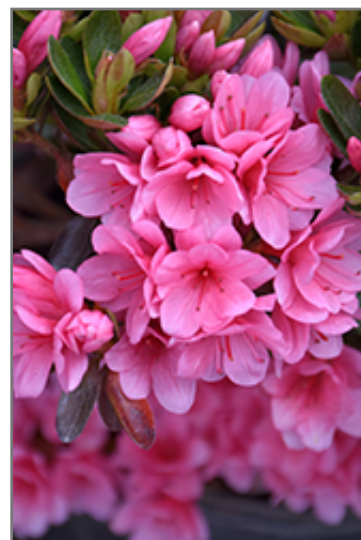
Coral Bells Azalea flowers