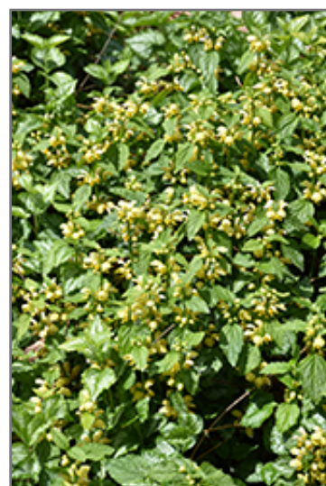
Yellow Archangel flowers