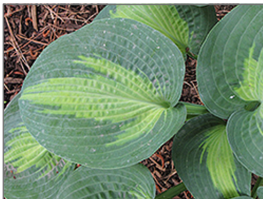
St. Paul Hosta foliage

St. Paul Hosta is recommended for the following landscape applications;