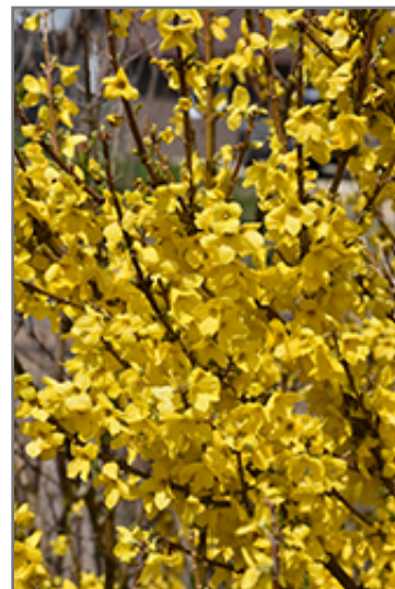
Show Off Forsythia flowers

Show Off Forsythia is recommended for the following landscape applications;