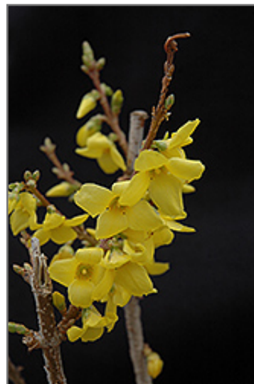
Show Off Forsythia flowers

This plant is not reliably hardy in our region, and certain restrictions may apply; contact the store for more information.