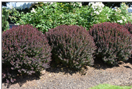
Pygmy Ruby Barberry