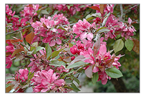
Crimson King Flowering Crab in bloom