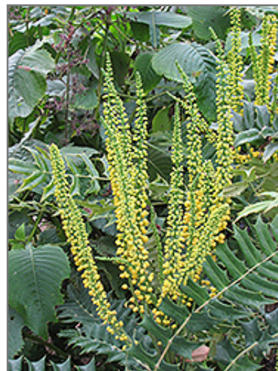
Chinese Mahonia flowers