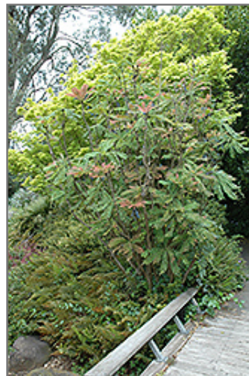
Chinese Mahonia

This shrub does best in partial shade to shade. It does best in average to evenly moist conditions, but will not tolerate standing water. It is not particular as to soil pH, but grows best in rich soils. It is somewhat tolerant of urban pollution, and will benefit from being planted in a relatively sheltered location. Consider applying a thick mulch around the root zone in winter to protect it in exposed locations or colder microclimates. This species is not originally from North America.