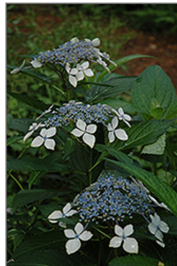
Princess Lace Hydrangea flowers

This variety produces stellar, light pink or blue lacecap blooms depending on soil pH, on strong upright stems, over luxurious, large, shiny green foliage; can be grown in zone 5 with good winter protection; a gorgeous, elegant addition to the garden