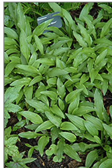
Tucker Wave Hosta foliage