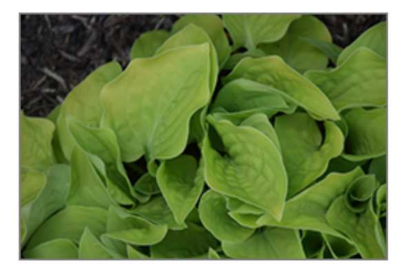
Heart Broken Hosta foliage

Heart Broken Hosta is recommended for the following landscape applications;