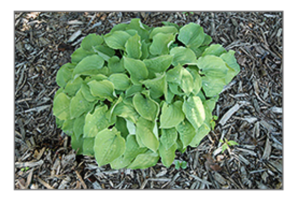
Heart Broken Hosta