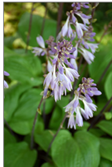
Designer Genes Hosta flowers

This plant does best in partial shade to shade. It prefers to grow in average to moist conditions, and shouldn't be allowed to dry out. It is not particular as to soil type or pH. It is somewhat tolerant of urban pollution. This particular variety is an interspecific hybrid. It can be propagated by division; however, as a cultivated variety, be aware that it may be subject to certain restrictions or prohibitions on propagation.