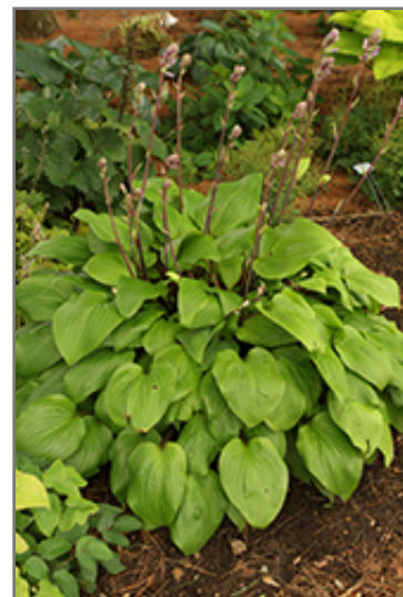
Designer Genes Hosta