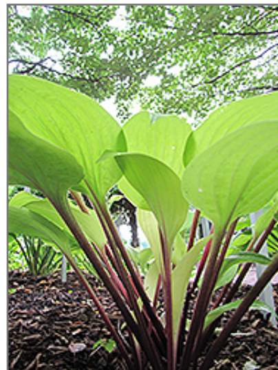
Designer Genes Hosta foliage