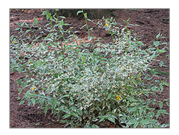
Picta Japanese Kerria

This shrub performs well in both full sun and full shade. It does best in average to evenly moist conditions, but will not tolerate standing water. It is not particular as to soil type or pH. It is highly tolerant of urban pollution and will even thrive in inner city environments. This is a selected variety of a species not originally from North America.