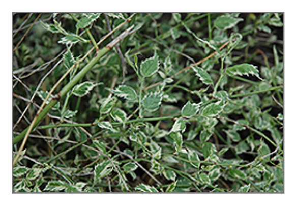
Picta Japanese Kerria foliage