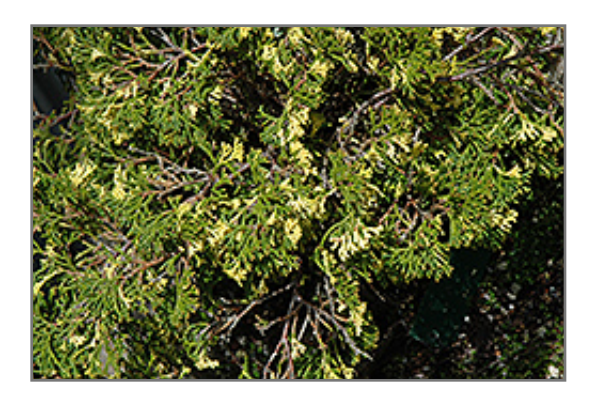
Sparkles Hinoki Falsecypress foliage