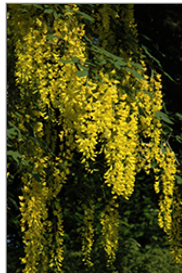
Weeping Laburnum flowers