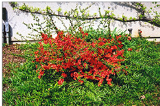
Common Flowering Quince in bloom

This is a high maintenance shrub that will require regular care and upkeep, and should only be pruned after flowering to avoid removing any of the current season's flowers. Gardeners should be aware of the following characteristic(s) that may warrant special consideration;