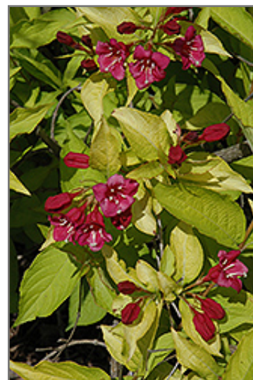
Rubidor Weigela flowers

Rubidor Weigela is recommended for the following landscape applications;