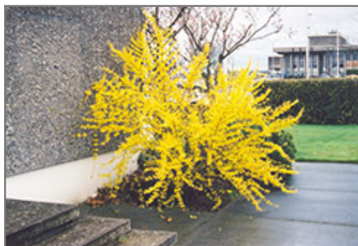
Showy Border Forsythia in bloom