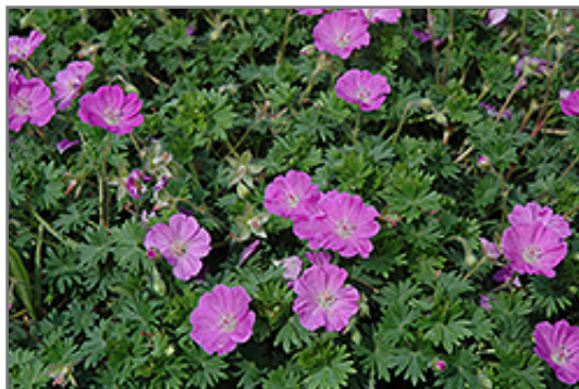
Little Bead Cranesbill flowers

Little Bead Cranesbill is recommended for the following landscape applications;