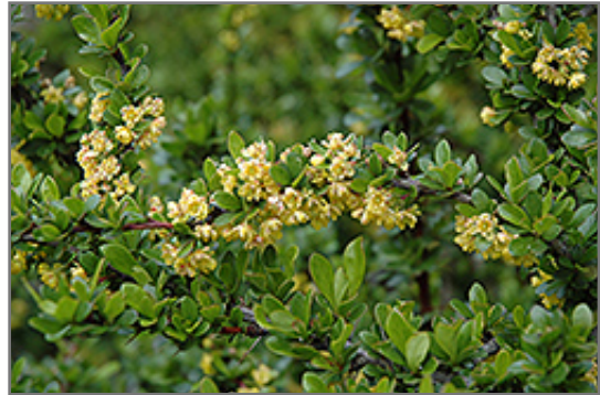
Sparkle Japanese Barberry flowers

This shrub does best in full sun to partial shade. It is very adaptable to both dry and moist growing conditions, but will not tolerate any standing water. It is considered to be drought-tolerant, and thus makes an ideal choice for a low-water garden or xeriscape application. It is not particular as to soil type or pH, and is able to handle environmental salt. It is highly tolerant of urban pollution and will even thrive in inner city environments. This is a selected variety of a species not originally from North America.