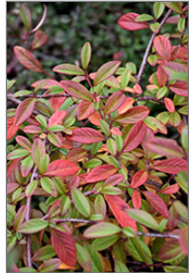
Scarlet Leader Willowleaf Cotoneaster in fall

This shrub does best in full sun to partial shade. It is very adaptable to both dry and moist growing conditions, but will not tolerate any standing water. It is not particular as to soil type or pH, and is able to handle environmental salt. It is highly tolerant of urban pollution and will even thrive in inner city environments. This is a selected variety of a species not originally from North America.