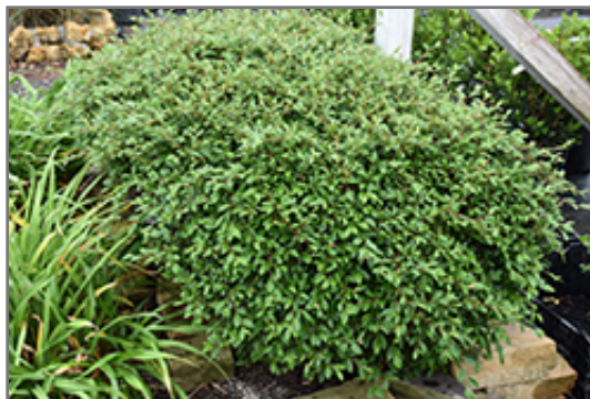
Scarlet Leader Willowleaf Cotoneaster

This shrub will require occasional maintenance and upkeep, and should not require much pruning, except when necessary, such as to remove dieback. It is a good choice for attracting birds to your yard, but is not particularly attractive to deer who tend to leave it alone in favor of tastier treats. Gardeners should be aware of the following characteristic(s) that may warrant special consideration;