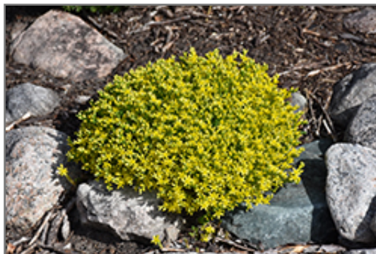
Golden Moss Stonecrop in bloom

Golden Moss Stonecrop is recommended for the following landscape applications;