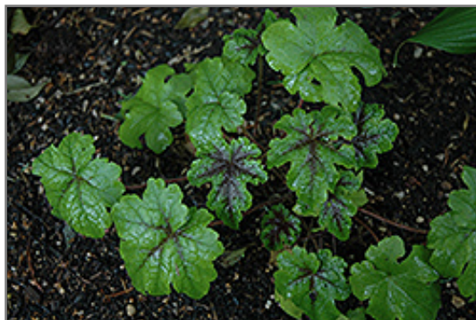
Jeepers Creepers Foamflower flowers

This fine selection displays a bold contrast in leaf color making it desirable in the woodland garden; flowers are larger than other varieties and the plant is more clumping than spreading