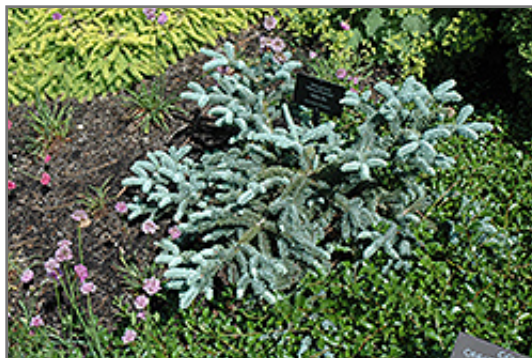
Prostrate Blue Noble Fir