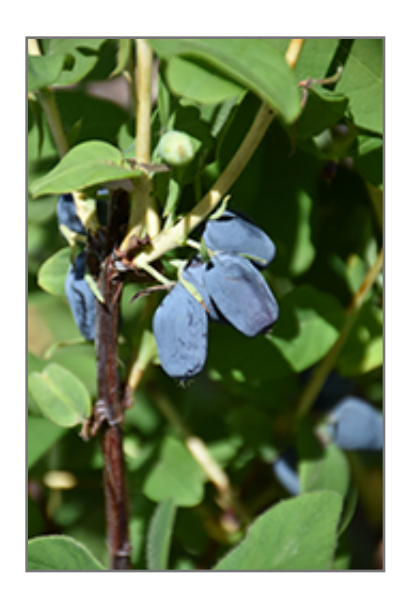
Berry Smart Blue Honeyberry fruit