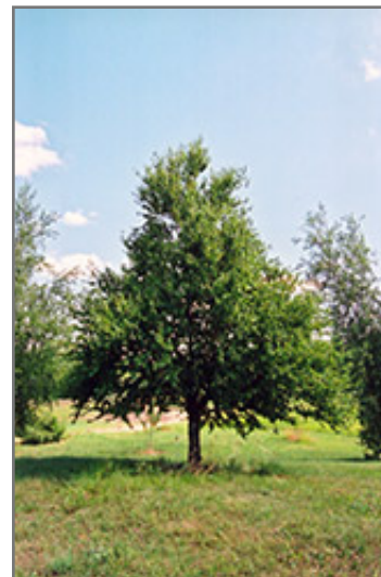
Sweet Birch