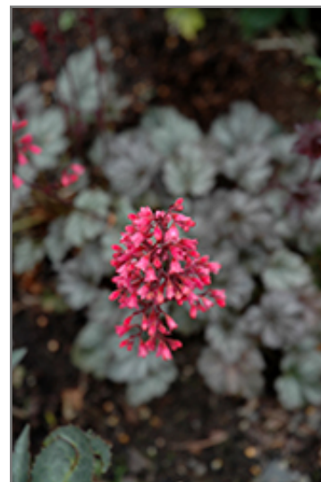
Rave On Coral Bells flowers