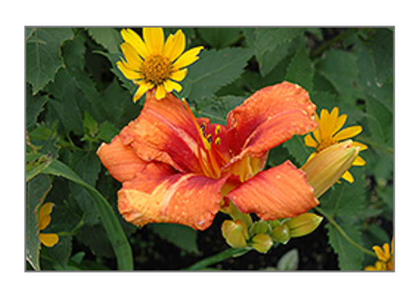
Tigger Daylily flowers

Outstanding, rebloomer with miniature trumpets; golden-peach with red band around a gold-green throat; sturdy, strong, easy to care for, great grassy texture and form; good for the beginner gardener and the pro