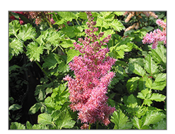
Stand and Deliver Astilbe flowers