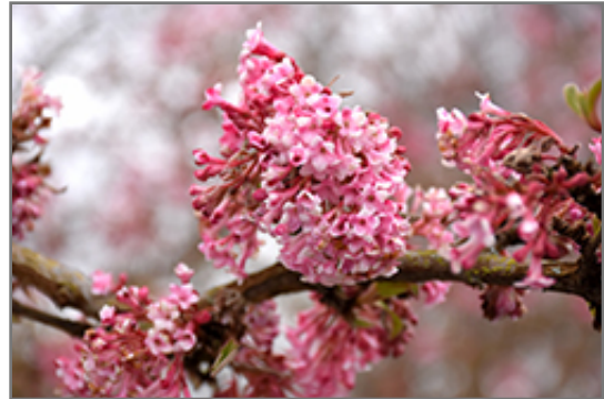
Dawn Viburnum flowers

Dawn Viburnum is recommended for the following landscape applications;