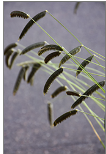
Freeda Compact Black Caterpillar Grass flowers