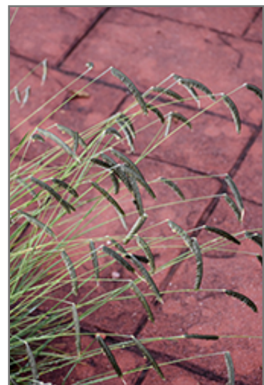
Freeda Compact Black Caterpillar Grass flowers