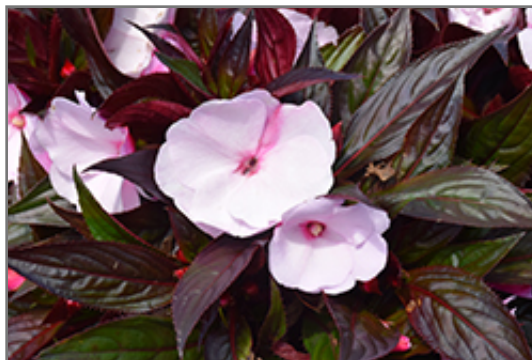
Petticoat Neon Night New Guinea Impatiens flowers

Petticoat Neon Night New Guinea Impatiens is recommended for the following landscape applications;