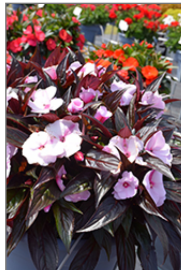
Petticoat Neon Night New Guinea Impatiens in bloom