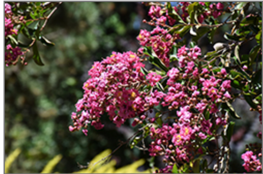
Pecos Crapemyrtle flowers

Pecos Crapemyrtle will grow to be about 12 feet tall at maturity, with a spread of 10 feet. It has a low canopy with a typical clearance of 1 foot from the ground, and is suitable for planting under power lines. It grows at a medium rate, and under ideal conditions can be expected to live for approximately 20 years.