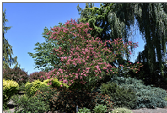
Pecos Crapemyrtle in bloom

Pecos Crapemyrtle is recommended for the following landscape applications;