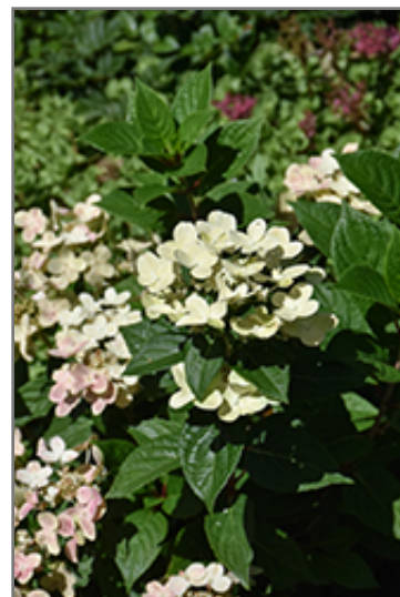
Early Evolution Hydrangea flowers