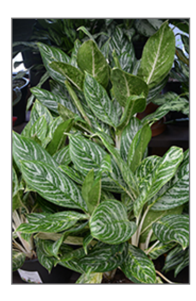
Golden Madonna Chinese Evergreen in full