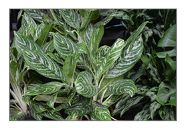
Golden Madonna Chinese Evergreen foliage