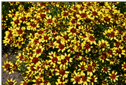
Firefly Tickseed flowers

Firefly Tickseed is recommended for the following landscape applications;