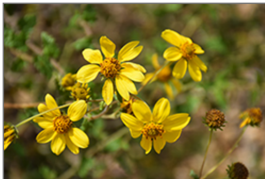
Parish's Goldeneye flowers