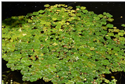
Four Leaf Water Clover

Four Leaf Water Clover is ideally suited for growing in a pond, water garden or patio water container, and is recommended for the following landscape applications;