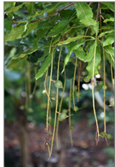
Beaumont Macadamia Nut fruit