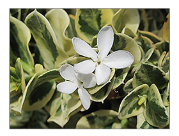
Variegated Carissa flowers

Variegated Carissa has attractive creamy white-variegated dark green foliage with hints of grayish green which emerges buttery yellow in spring on a plant with an upright spreading habit of growth. The glossy round leaves are highly ornamental and remain dark green throughout the winter. It features dainty fragrant white star-shaped flowers along the branches from early to late summer. It produces red berries from early fall to early winter.