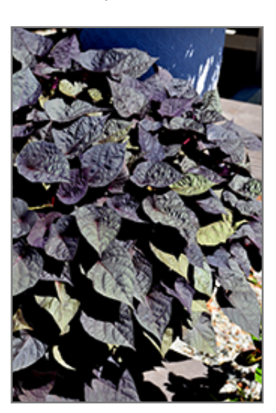
Spotlight Black Heart Sweet Potato Vine foliage