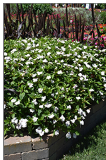
Solarscape White Shimmer Impatiens in bloom