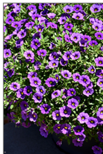
Cha-Cha Lavender Calibrachoa flowers