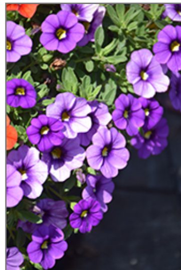
Cha-Cha Lavender Calibrachoa flowers

This plant will require occasional maintenance and upkeep. Trim off the flower heads after they fade and die to encourage more blooms late into the season. It is a good choice for attracting bees and hummingbirds to your yard, but is not particularly attractive to deer who tend to leave it alone in favor of tastier treats. It has no significant negative characteristics.