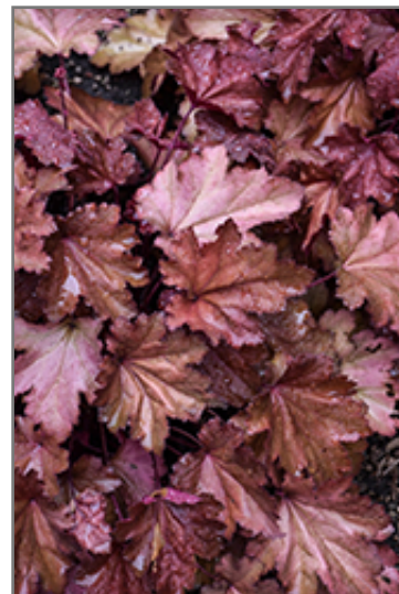
Magma Coral Bells foliage

Magma Coral Bells is recommended for the following landscape applications;