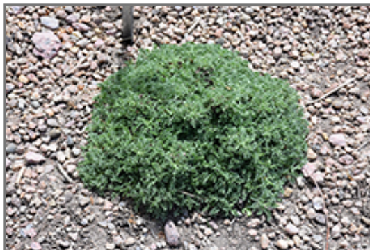
Carpeting Pincushion Flower