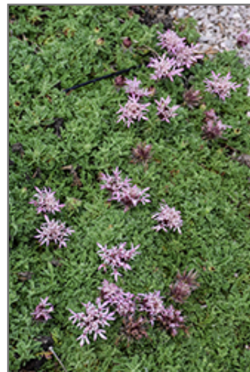
Carpeting Pincushion Flower in bloom

Carpeting Pincushion Flower is a dense herbaceous evergreen perennial with a ground-hugging habit of growth. It brings an extremely fine and delicate texture to the garden composition and should be used to full effect.